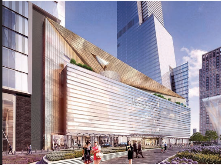
W&W Glass LLC (No. 197) won the contract for the West Podium Art Wall for the Shops at Hudson Yards in Manhattan, a 315-ft x 72-ft facade made up of 700 panels of curved printed glass supported by pre-tensioned cables.

style games that we were all subject to during the downturn four to six years ago,” Haber says.